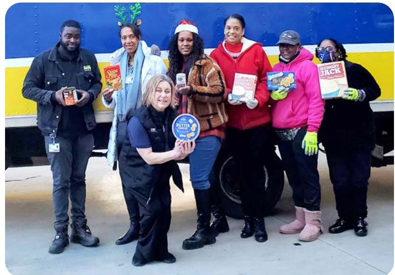
▲ Associates at MedStar Good Samaritan Hospital filled grocery tote bags to feed families at the Cares Food Bank, part of the Warm Hearts project. This annual gift of giving is now in its 16th year.