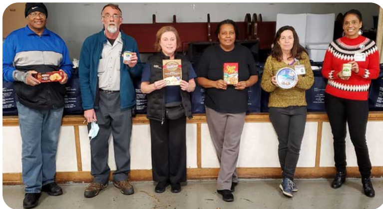
▲ For the 7th annual year, the Warm Hearts project at MedStar Union Memorial Hospital delivered filled tote bags, which were donated by hospital associates, to Grace Baptist Church.