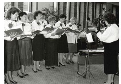
The 63rd annual Women's Board Picnic and Bazaar