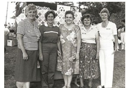
The Women's Board Gift Shop opens