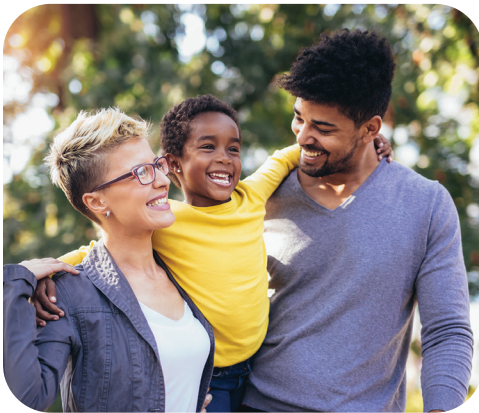
Families that play and make healthy choices together develop more resilience during the COVID-19 pandemic.

"Some of us are just not as resilient as others, and are more predisposed to anxiety and depression that can escalate quickly when stressed," she says. "We are seeing more cases of seriously depressed patients who need hospitalization to heal than before COVID-19 struck."