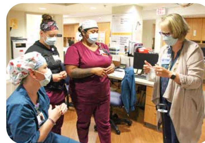
Wellness rounds is one of many programs aimed at improving employee wellbeing at MedStar St. Mary's Hospital.