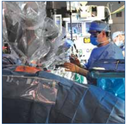
At MedStar Georgetown, surgeons use the da Vinci Surgical System, described on page 4, to make delicate, tiny movements through incisions less than one-half inch long.

Hormone therapy is the standard of care for metastatic prostate cancer—cancer that has spread beyond the gland—as well as other advanced cancers or as a complementary treatment if prostate cancer returns. Unlike radiation and surgery, hormone therapy is not expected to cure the cancer; however, it can stop or even reverse the disease's progression.