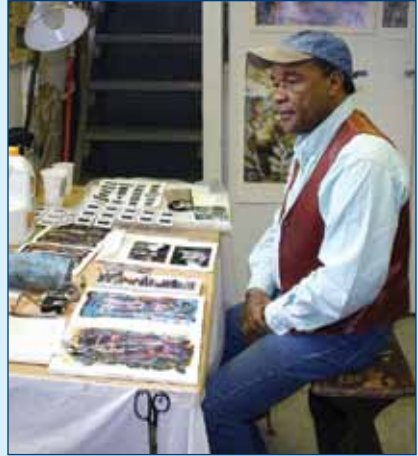
David Driskell in his Hyattsville, Maryland, studio