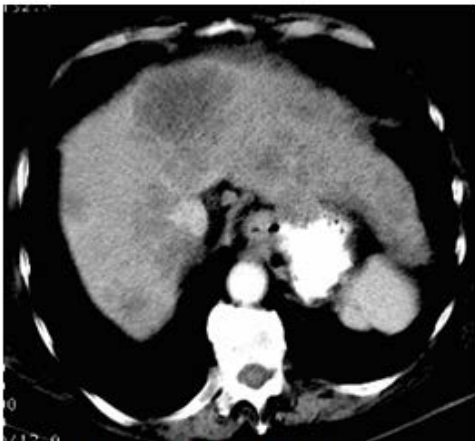
Fig. 1 Abdominal CT